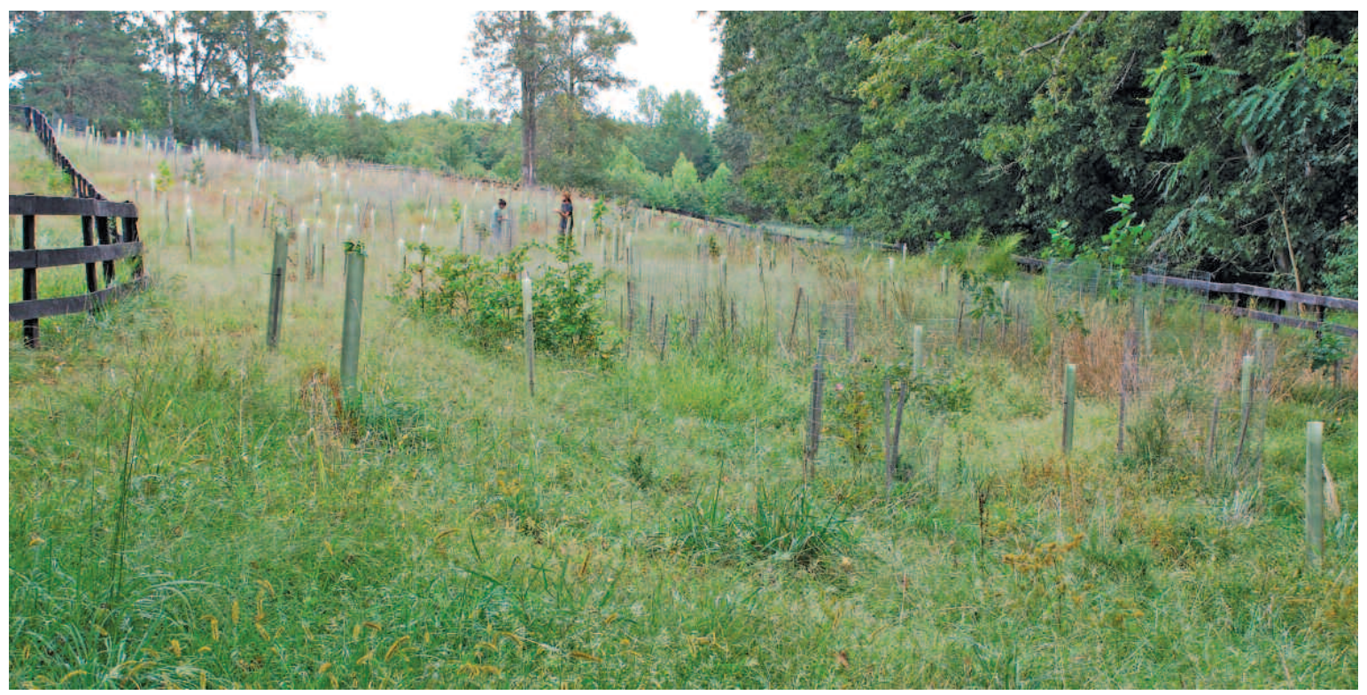
ENVIRONMENTAL AWARENESS. ECOLOGICAL RESTORATION. TROPICAL AGROFORESTRY NATIVE PLANT PROPAGATION FROM LOCAL ECOTYPES. GREEN BUDDHISM

On line: Time-lapse comparisons of other sites are available in the "Site Visit" slide show on our home page, earthsangha.org, and on our DC area field map, at earthsangha.org/dca/dcamap.html.