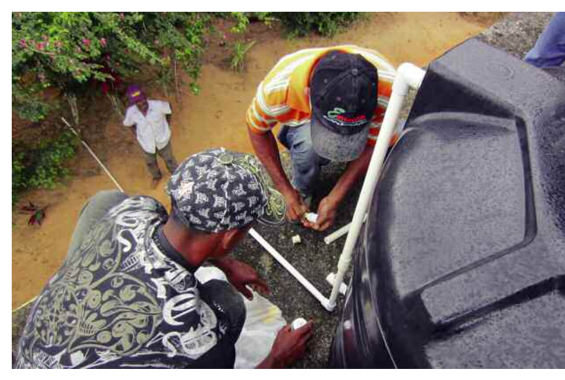
Photo: Last August, we installed a water filter on the roof of the elementary school in the village of Los Cerezos, in the heart of the Tree Bank project area. The filter provides students and staff with a source of parasite-free drinking water. The water itself comes from our new park, which protects the origins of the streams that flow into the village. The park helps guarantee the village water supply.